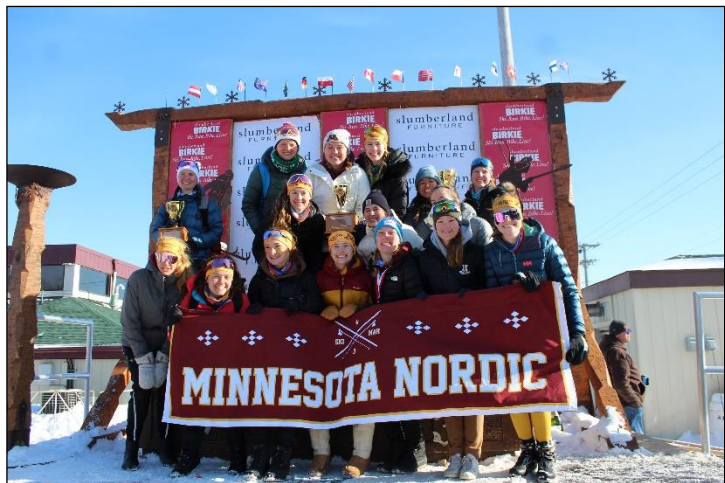
Above: The Women’s Midwest Collegiate Cup podium, 2023.

Full MCSA Nordic results from Mt. Ashwabay are available here .