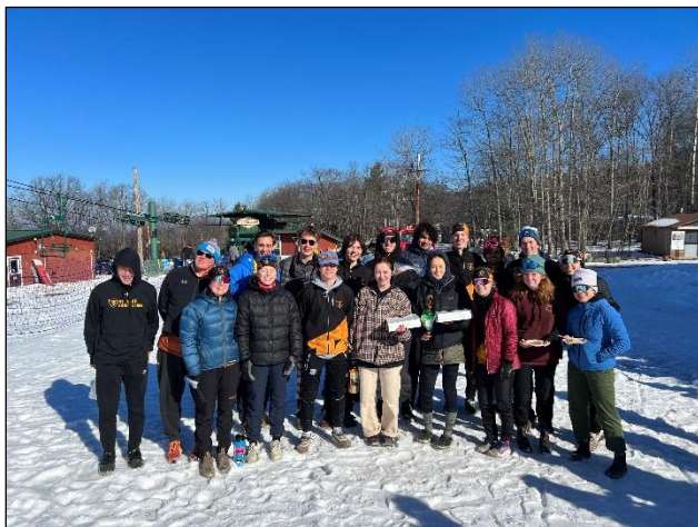
Above: St. Olaf College skiers pose with their pies at Mt. Ashwabay.