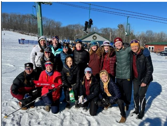
Below: The UWM, SOC, and UMNTC scoring Women at the finish line.