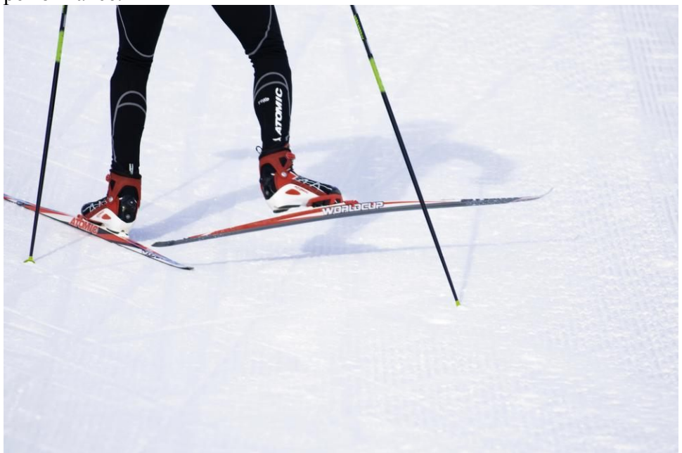
WITH BOA TECHNOLOGY YOU CAN PLACE HARSH LATERAL PRESSURE ON YOUR FEET AND HAVE ABSOLUTELY NO SIDE TO SIDE MOVEMENT