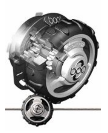
THE BOA RATCHET

BOA is a Colorado based company that offers the highest level of athletic boot and shoe fitting technology. This system uses a ratchet that controls a series of cables. These cables connect to the bottom of a soft rubber like plate that fits above the foot. It is the plate, not the cables, that goes over the foot. Turning the ratchet tightens the cables which pulls the plate over the foot. The end result is a secure fit that is far more comfortable and secure than the fit that comes with lacing. The plate can provide a snug fit without any pressure points that makes for great combination of comfort and