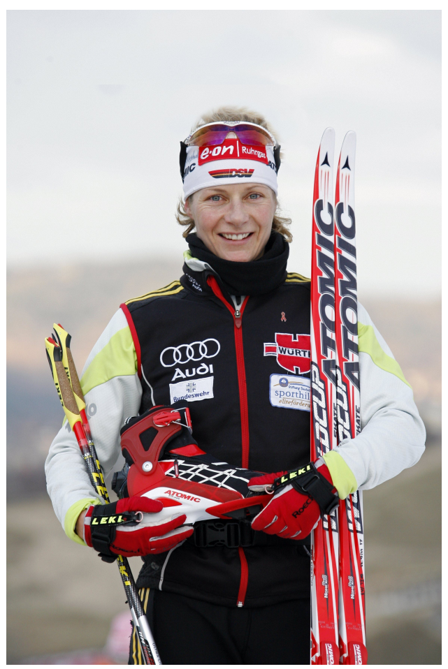
THE PERFORMANCE FEATURES OF THE BOA BOOTS WERE DEVELOPED BY ATOMIC'S ELITE ATHLETES.