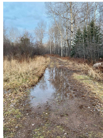
SISU race course heading into town.

With one week to go we have absolutely no snow on the ground, wet trails, and warm temps. There is only minor snow in the forecast with temps predicted to hover around freezing. Even if we receive more snow than predicted, we could not turn that snow into a safe race course. Therefore, we are canceling the SISU Ski Race.