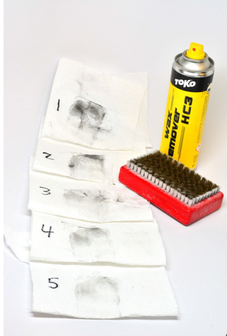
Figure 1: Dirt removed from ski bases with 5 consecutive applications of wax remover

After cleaning, the skis were treated with 3 applications of the Rex Blue control wax and were tested again. This time we found the control skis behaved as expected and matched the friction level of the test skis.