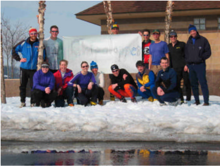
Chipaloppet 2004 participants.