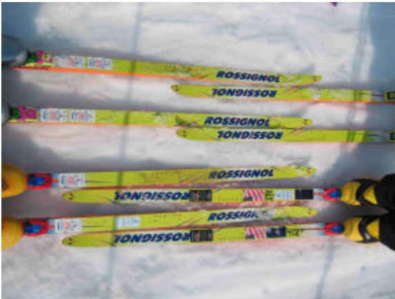
Artistry at its finest.