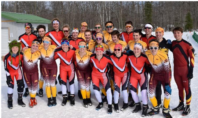
Throwback photos from 2020's inaugural MCSA Nordic Regional Championships, also held at Rhinelander's CAVOC.