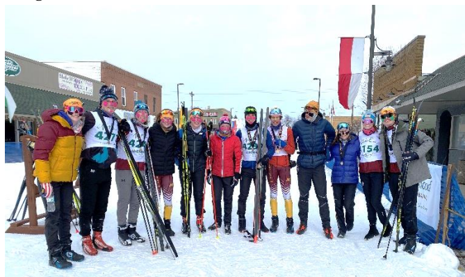
Below: University of Minnesota - Twin Cities Vasa and Dala finishers on Main Street, Mora.

While the Cup circuit has been no stranger to adverse weather this year, the 2022 Vasa-Dala may well stand as the coldest race in memory for many of Saturday's skiers – even given the merciful absence of wind. As Rogers and Evans' "Happy Trails" echoed across the Main Street start line, the thermometer stood at -11°F, and would not rise above -2°F for the duration of the day's races. Energy drinks and blueberry soup crusted beards, buffs, and bibs in orange and purple ice, and frostbite marked the cheeks and noses of many finishers. Braving the cold themselves, the Vasaloppet volunteers were essential to conducting a safe and successful event, diligently monitoring the course for at-risk skiers and pulling those in need of a fast warm-up. As University of St. Thomas President Nathan Hohenshell aptly noted, completing this year's race "was an achievement in and of itself" given the blistering temperatures – to say nothing of the blistering MCSA paces and intense competition that marked both the Vasa and Dala.