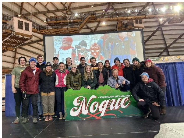
Above: UMD skiers celebrate in the Superior Dome.