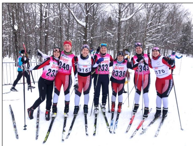
Above: UWM skiers before the start of Skate Wave 3.

The MCSA's Midwest Collegiate Cup got off to a searing start this weekend in Marquette, MI, with podium-packing performances and narrow margins opening what will doubtless be a captivating competitive season. As in years past, the Noquemanon Ski Marathon's Half-Noque 24k Skate and 24k Classic races constituted the Cup's first contests of 2023, affirming the league's strong connection to the event – and enabling college skiers to benefit yet again from the Noquemanon's enthusiastic volunteers and generous support. Indeed, the Half-Noque proves an increasing draw for collegiate athletes: this was the MCSA's largest season opener to date, with 101 skiers across 16 teams racing (additional skiers competed in the unscored 50k Skate and Classic events).