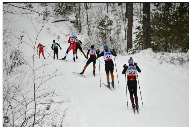
Above: Scenes from the Men’s and Women’s 10k Skate.