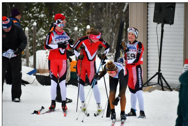
Scenes from the Women's Classic Sprint.