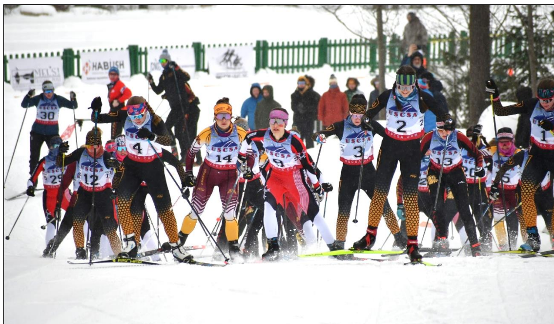
Above: The start of the Women's 10k Skate on Sunday, February 16 th.

Saturday Sprint is MCSA's first-ever; SOC Women take third consecutive title; SOC Men win first Championship