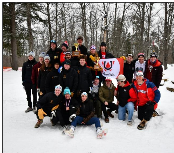
Left: MCSA Regional Championship Team Scores. Above: Men's Regional Championship Podium. Below: Women's Regional Championship Podium.