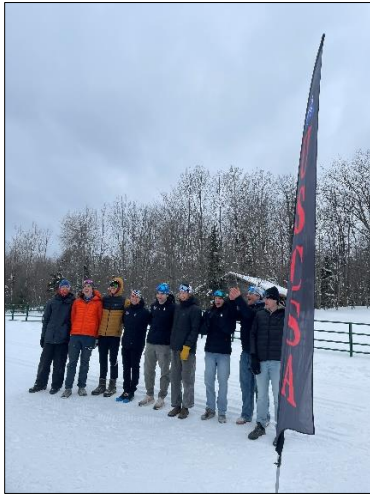
Above: Men's Team Sprint podium. Below: Women's Team Sprint podium.