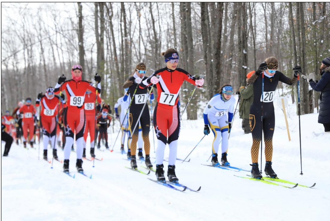
Above: Start of the Women's 30k Mt. Ashwabay Summit Skiathlon.

Badger Men & Women take breakout leads despite St. Olaf individual wins; first MCSA Team Sprint a success in Ironwood