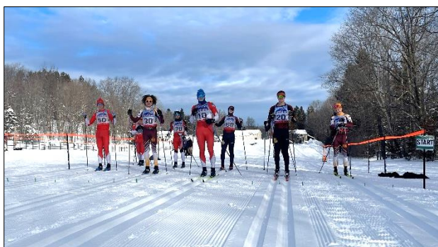
Above: Start of the Men's Team Sprint. Below: Start of the Women's Team Sprint.