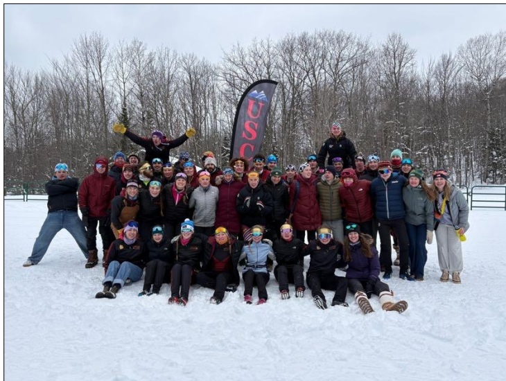
Above: MCSA teams at the ABR Team Sprint, February 1, 2026.