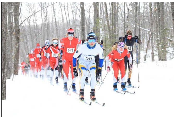
Above: Start of the Men's Skiathlon.