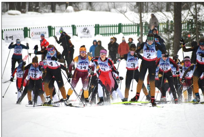
Above: Start of the Women’s 10k Skate at the 2025 MCSA Regional Championships. Below: 2025 Midwest Collegiate Cup podium, Men’s Division.