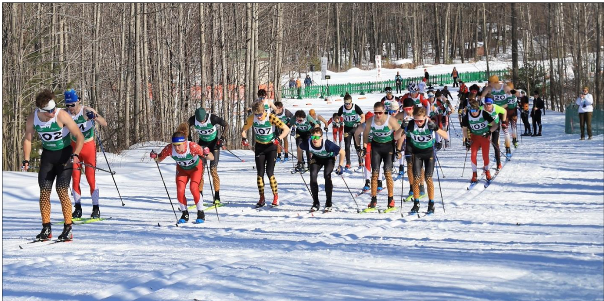
Above: Start of the Men's 10k Classic Mass-Start on Sunday, 2/15.

St. Olaf wins Men's and Women's titles; defending champs Ward & Rova win it all; Collegiate Cup standings secure ahead of American Birkebeiner