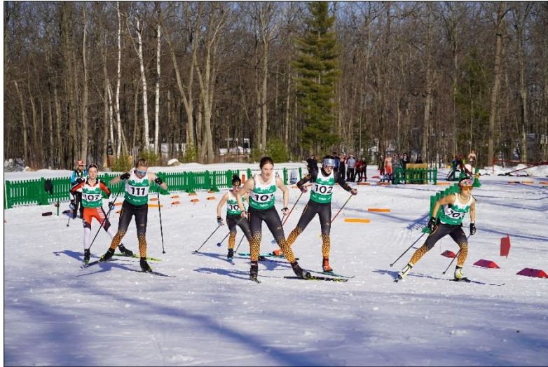
Above: Start of the Women's Skate Sprint Final on Saturday, 2/14. Below: Start of the Men's Skate Sprint Final on Saturday, 2/14.

the 2026 Midwest Collegiate Cup, with points awarded using the conventional Mathie-Halvorson System. With the exception of 2026's new ABR Team Sprints , the Regional Championships are the only collegiate-distance events of the MCSA's season—inviting skiers to test their cardiovascular redlines, and their technical racing-lines, ahead of the American Birkebeiner and, thereafter, the National Championships.